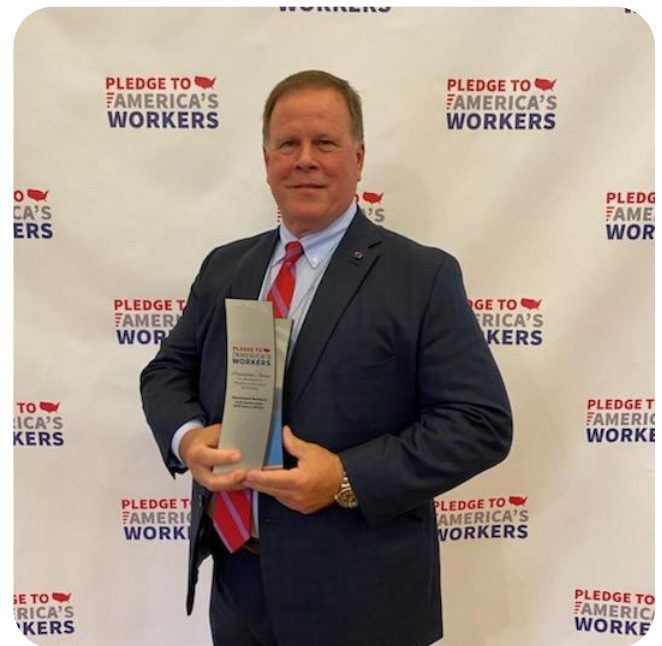
ABC Receives the Pledge to America's Workers Presidential Award 2020