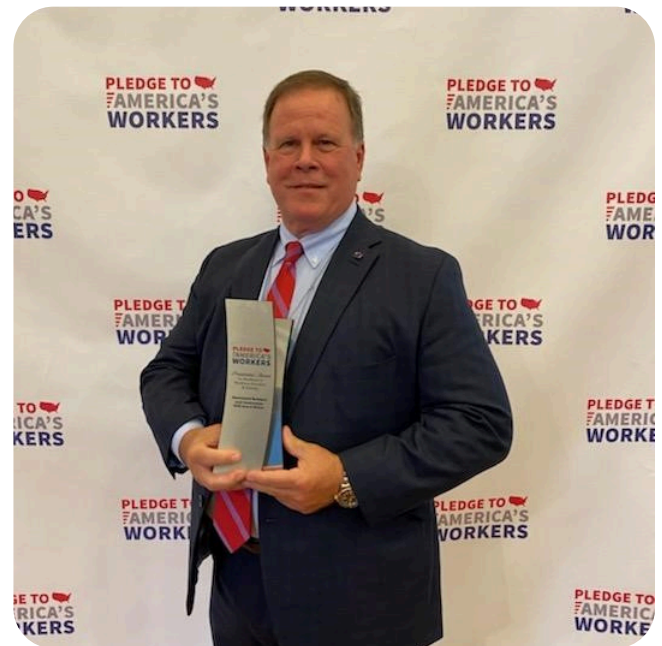
ABC Receives the Pledge to America's Workers Presidential Award 2020