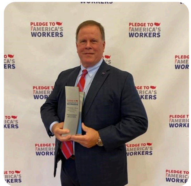
ABC Receives the Pledge to America's Workers Presidential Award 2020